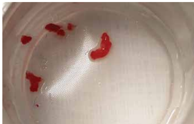
Fig 4 - Fresh thrombus which was aspirated from the distal obtuse marginal 2 (OM2).