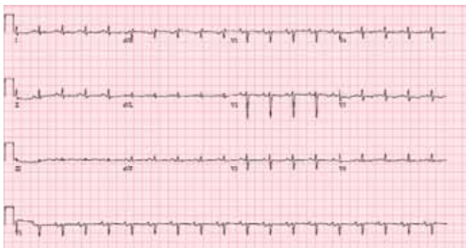
Fig 1 - Electrocardiogram: with lateral T wave inversion.