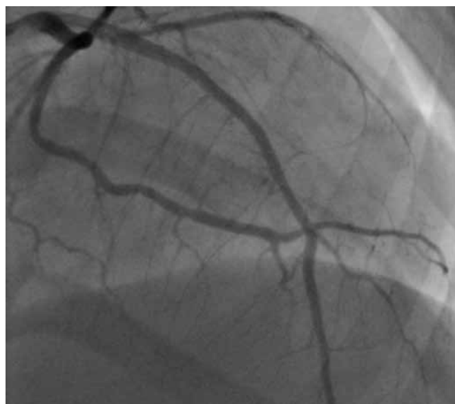
Fig 5 - Repeat images demonstrating resolution of the stenosis in the obtuse marginal 2 (OM2).