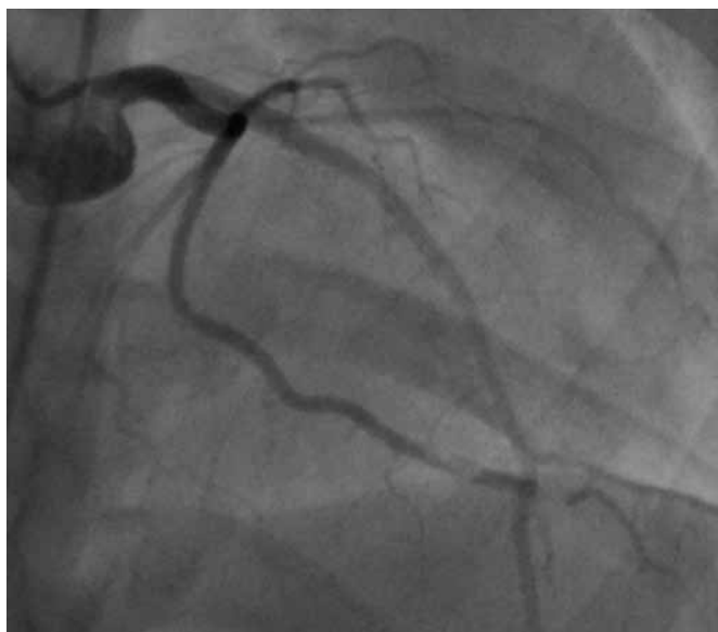
Fig 3 - Two sequential thrombi in the distal segment of the obtuse marginal 2 (OM2).

and was successful with the resolution of thrombus as documented angiographically (Fig. 5). Based upon these results, we propose that it be considered as a treatment modality in future similar cases in the absence of contraindications.